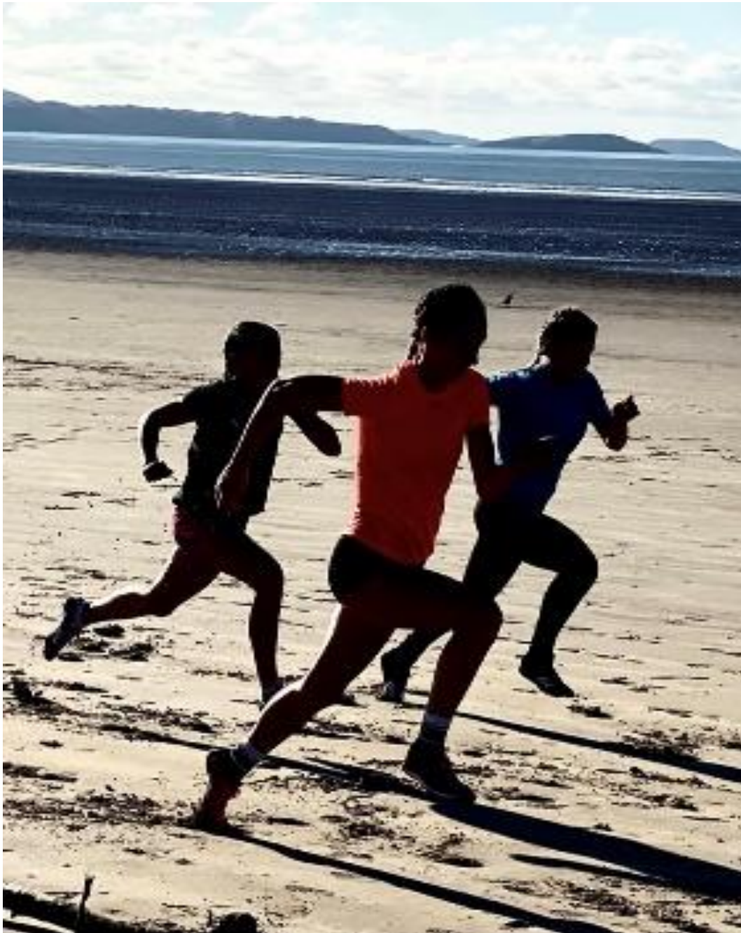
Training on Pembrey beach Summer, 2020